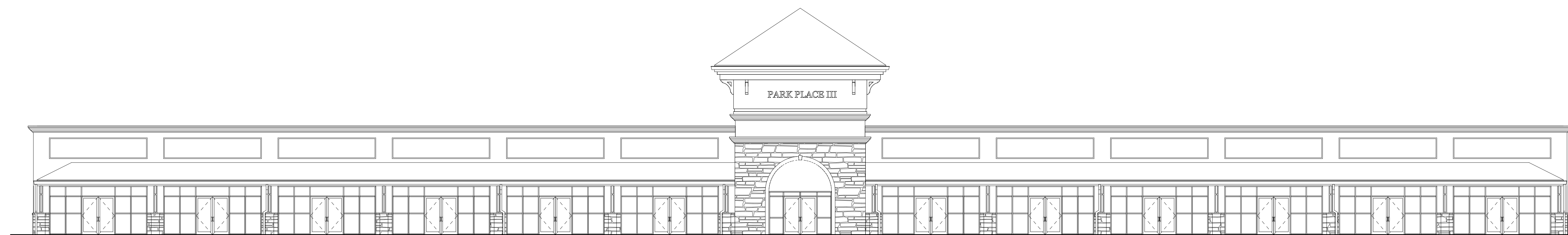
MAIN ELEVATION SCALE: 1" = 10'-0"