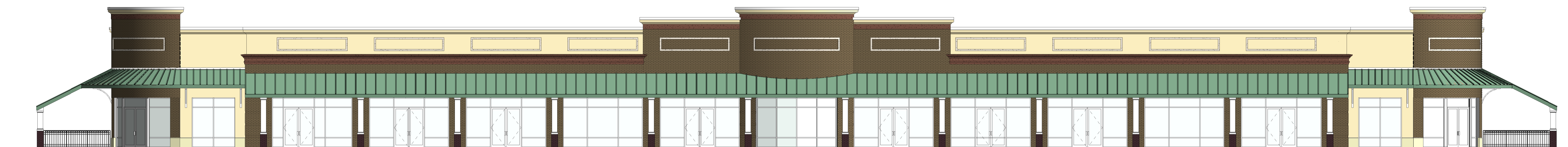
MAIN ELEVATION SCALE: 1" = 10'-0" SHEET: T-1.1