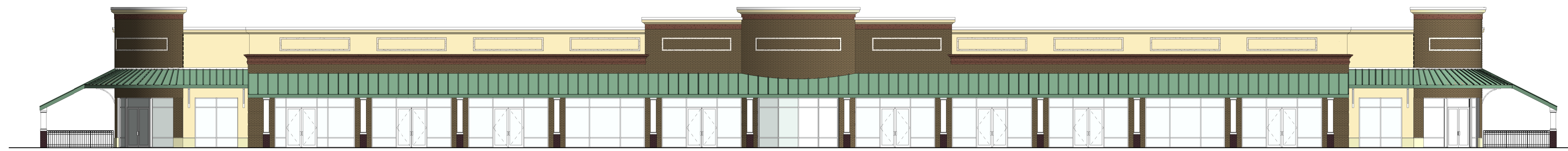
MAIN ELEVATION SCALE: 1" = 10'-0" SHEET: T-1.1