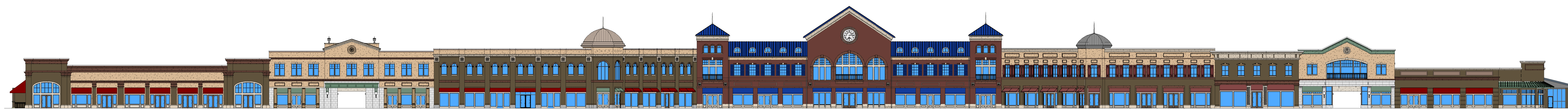
MAIN ELEVATION SCALE: 1" = 30'-0"