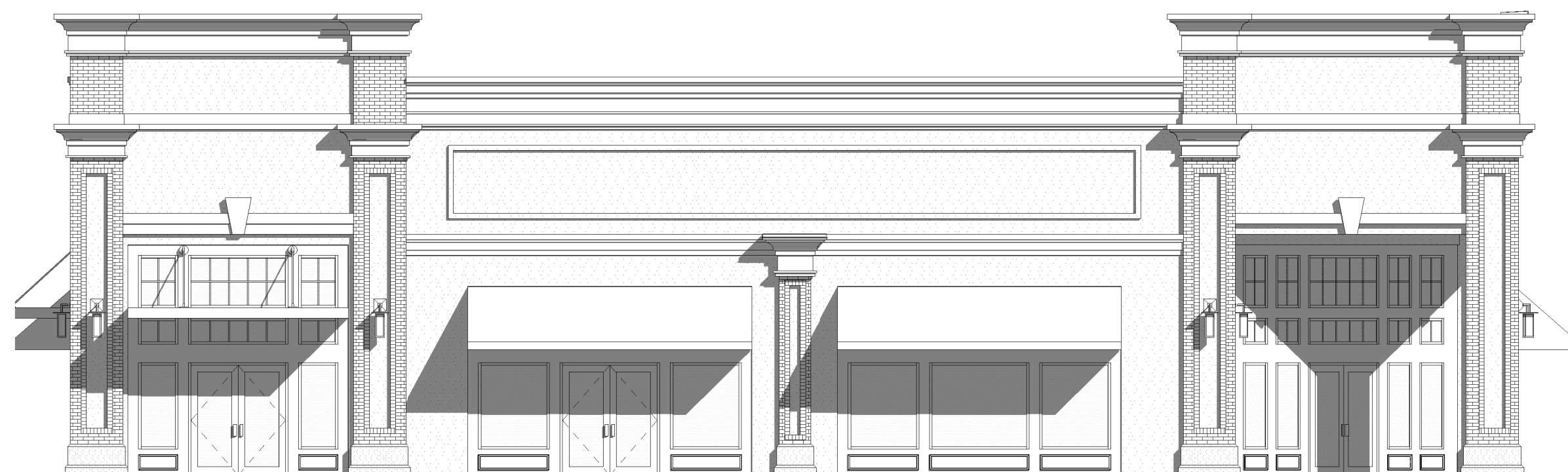
02 LEASE - WEST ELEVATION SCALE: 1/8" = 1'-0" REF. VIEW: LP1