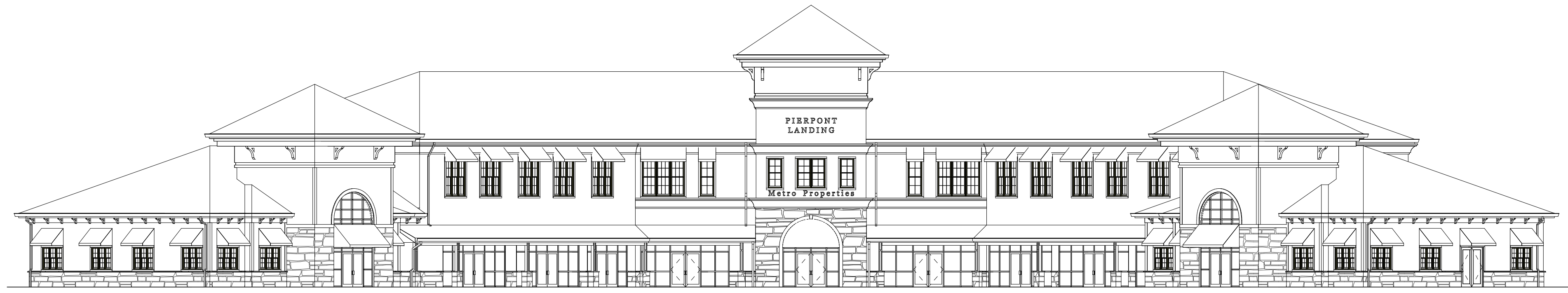
MAIN ELEVATION SCALE: 1/16" = 1'-0"