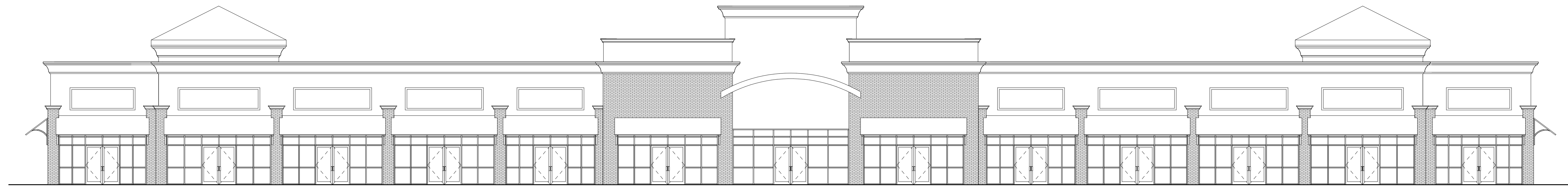
MAIN ELEVATION SCALE: 1" = 10'-0"